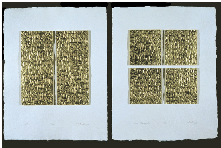
Collagraph mixed media 1994 Two 18 x 14 in. panels $700/$850 framed

With one additional horizontal cut, the tablets of the Law become four quadrants, suggesting a cross. Jesus said he came to fulfill the Law. When we have finished an item on our list of items to be done, we put a line through it, marking it done. This is what I was thinking as I took the Law, marked it done, with a horizontal line, only to see a cross appear.