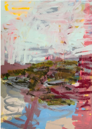
Landscape 2018 28 x 18 in. Acrylic & Flashe Paint on Paper on Board $1,550