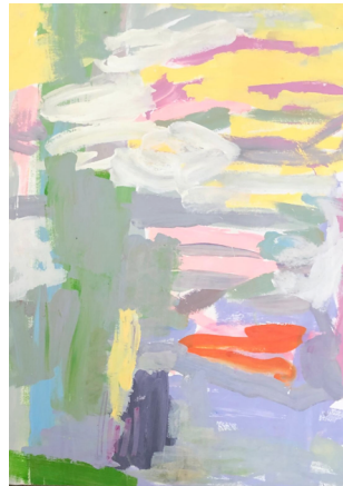
Summer Sky 2018 28 x 20 in. Acrylic & Flashe Paint on Paper on Board $1,550