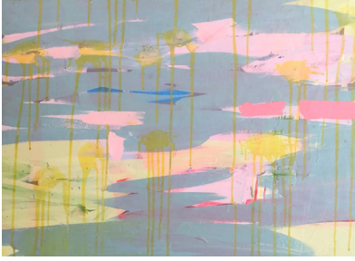
There is a River 2018 20 x 28 in. Acrylic & Flashe Paint on Paper on Board $1,550