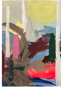
Breakthrough 2018 20 x 16 in. Acrylic & Flashe Paint on Paper on Board $1,250