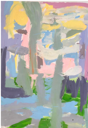
Sky, Trees & River 2018 28 x 20 in. Acrylic & Flashe Paint on Paper on Board $1,550