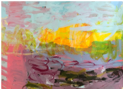
The Next Day 2018 20 x 28 in. Acrylic & Flashe Paint on Paper on Board $1,550