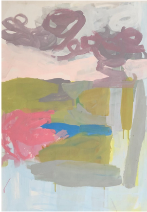
Cloudy Day 2018 28 x 20 in. Acrylic & Flashe Paint on Paper on Board $1,550