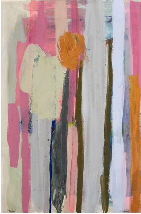
Hope 2018 28 x 18 in. Acrylic & Flashe Paint on Paper on Board $1,450