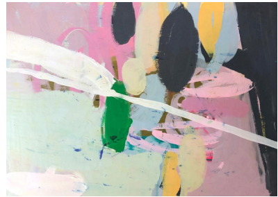
Through the Trees 2018 20 x 28 in. Acrylic & Flashe Paint on Paper on Board $1,550