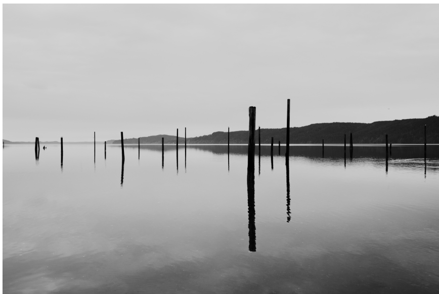
Cassie Marino, "Out Deeper"